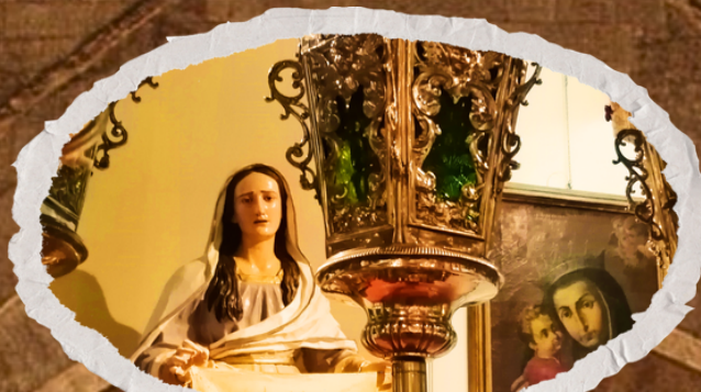
STATUE OF VERONICA, PAINTING OF THE MOTHER OF GOD. PROCESSIONAL LAMPS (Diocesan Museum)