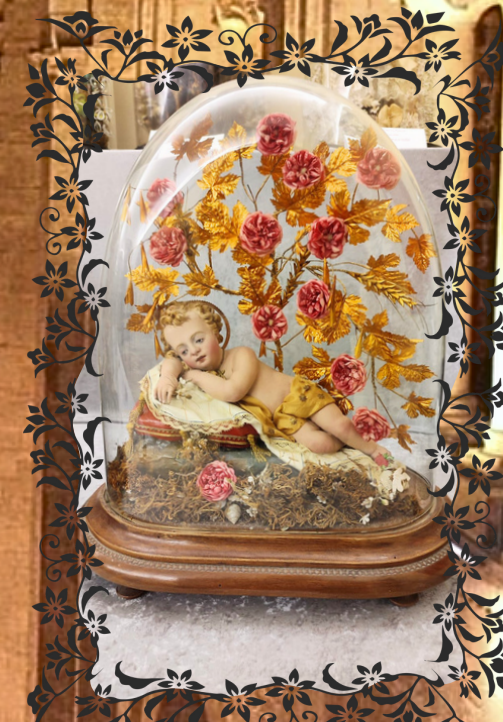
CHILD JESUS SLEEPING ("Beatrice Andriano" Hall)