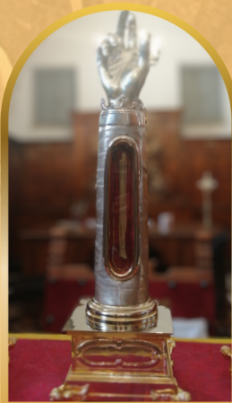
RELIQUARY ARM (SAINT MAURO)

The bones of the three saints, Mauro, bishop, Sergio and Pantaleone, are stored in precious reliquary, in the shape of busts and arms.