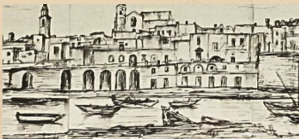
A, CARELLA, Bisceglie's harbour