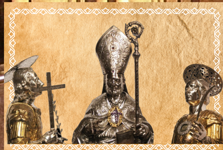
RELICS OF THE PATRON SAINTS (Crypt)